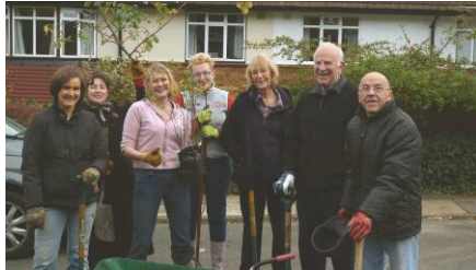
Figure 18 - Local volunteers planting trees on community space on Springfield Avenue

Further promotion of the sustainable food projects in and around Muswell Hill will be needed over the coming year to encourage greater involvement from the local community, and raise awareness of the financial and environmental benefits of a more environmentally friendly approach to food production and consumption.