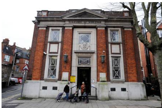
Figure 6 - Muswell Hill Library