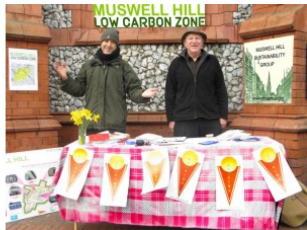
Figure 14 - En10ergy volunteers running an information stall on the Broadway

The project as a whole has been promoted through the use of lamppost banners on Muswell Hill Broadway, the development of a dedicated section on the council's website, and a number of articles in the local press. The members of the steering group have also used street parties and other local events they have organised or participated in to promote the scheme, and will continue to do so over the coming year.