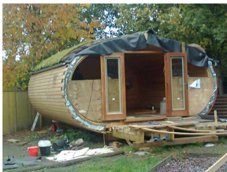
Figure 9 - The LivingArk under construction

A completely different approach has been taken at Muswell Hill Primary School, which is located within the boundaries of the Low Carbon Zone. A pioneering zero-carbon educational cabin called the LivingARK has been constructed as part of that school's nature garden, which demonstrates many different technologies and materials that have a zero environmental footprint. These include a living 'green roof', sheep's wool insulation, composting toilet, low-e glass, solar PV panel and FSC-certified wood. The LivingARK is designed to be used by schools in the borough,