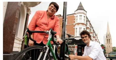
Figure 17 - Cycle hoops on Muswell Hill Broadway

Further work on sustainable travel is planned for the coming year, including an event organised by En10ergy with support from the council which is scheduled for June 2010. Targeted projects designed to encourage a shift away from use of cars will also be developed.