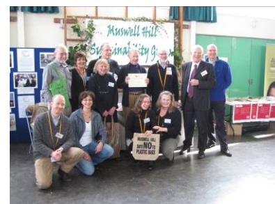
Figure 1 - MHSG members at LCZ launch.

A steering group was established to agree on the direction, expenditure, communications and other key aspects of the project. This group comprises members of the Muswell Hill Sustainability Group, local residents and staff from Haringey Council, alongside representatives from London Sustainability Exchange, En10ergy and an academic from University of East Anglia who is using the project as a case study. Representatives from local schools and the Traders' Association are also invited periodically.