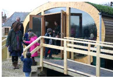
Figure 11 - School children and parents visiting the LivingARK at Muswell Hill Primary School

The staffing and resources available at the council to work with schools and deliver environmental education has changed, so consideration will be given over the coming months as to how to effectively continue using and engaging with schools in the delivery of the Low Carbon Zone project.