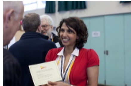
Figure 3 – A new en10ergy share holder

Prior to the launch of the Low Carbon Zone project, the council awarded a Green Innovations Fund grant to the Muswell Hill Sustainability Group to help set up a community-run social enterprise to develop and deliver renewable energy projects. En10ergy was established in October 2009, and its members have played an important role in the Low Carbon Zone project.