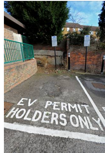
Figure 16 - Electric car charging bay near Marks and Spencers