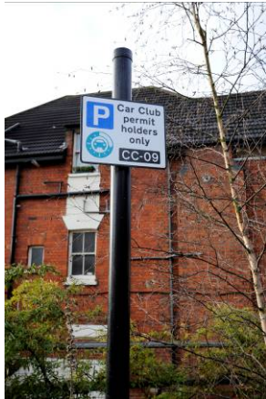
Figure 15 - Car sharing bay on Springfield Avenue

The Low Carbon Zone project has embraced other aspects of environmental sustainability, alongside its main focus on energy efficiency and renewable energy. The steering group recognised that approaching residents through aspects such as travel and sustainable food could help to engage the interest of those who had not responded to normal messages on carbon emissions and financial savings.