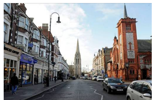
Figure 12 – A view of the shops along Muswell Hill Broadway

The Muswell Hill Traders Group was established shortly before the launch of the Low Carbon Zone project, and the council and LSx began to attend meetings of this group as a first step in engaging with the local business community. This led to the development of an environmental audit programme in order to help businesses identify where and how improvements could be