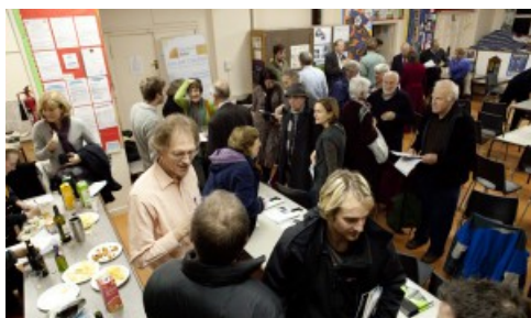
Figure 2 - En10ergy's launch of the Low Carbon Buying Group