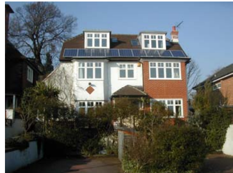
Figure 5 - LCZ Home with Solar PV bought from Low Carbon Buying Group

Alongside the Green Home Makeover project, en10ergy has launched a Low Carbon Buying Group, which is working with local contractors to secure discounts on boilers, solar panels and solar hot water for residents in the area.