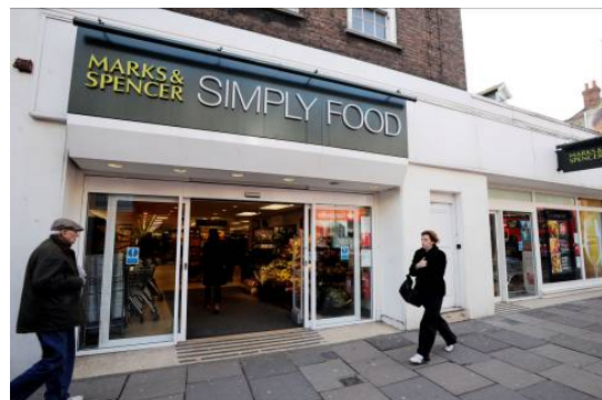
Figure 7 - The Muswell Hill M&S store

There was recognition from the outset of the Low Carbon Zone project that awareness and interest in the project could be raised through the development of exemplar schemes within the community.