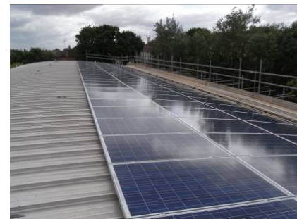
Figure 8 - Solar PV array installed on Fortismere sports hall.

Three schools, namely Rhodes Avenue Primary, Alexandra Park Secondary and Fortismere (secondary), have benefited from the installation of solar PV arrays to generate electricity. These have been complemented with real-time digital information boards and informative educational displays to help users of the school understand how these panels use the sun's energy to generate electricity and how much is being produced. Staff from the council have also worked with the school to develop workshops and themed lessons relating to the panels. Each school has signed a Service Level Agreement relating to the operation of the panels, which also sets out how the Feed-In Tariffs that each array will generate will be used to fund environmental action within the borough.